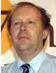
Mr. Richard SCRUTON