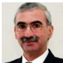
Dr. Jean-François KAHN (FRA)