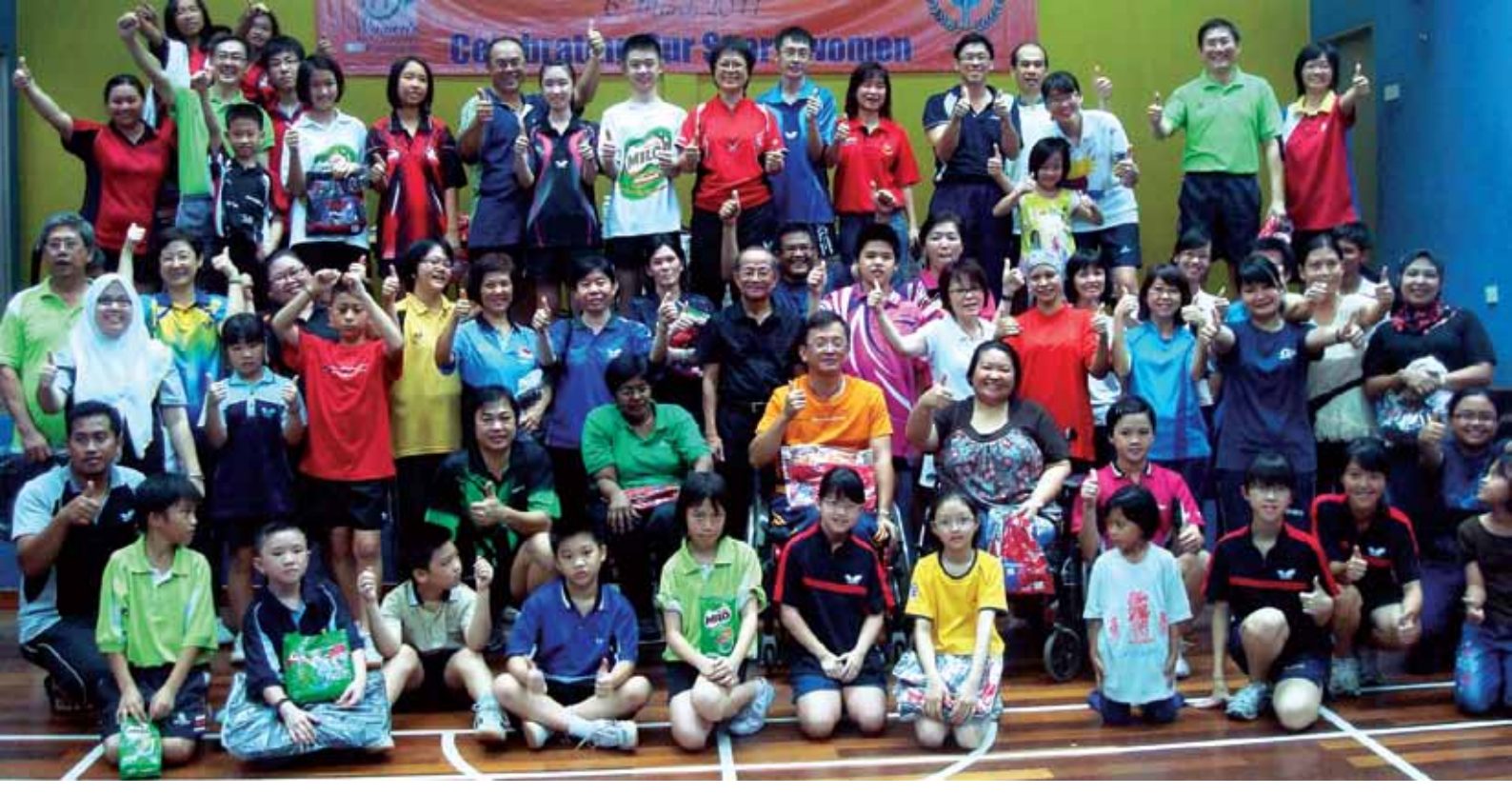
TABLE TENNIS FOR EVERYONE, EVERYWHERE